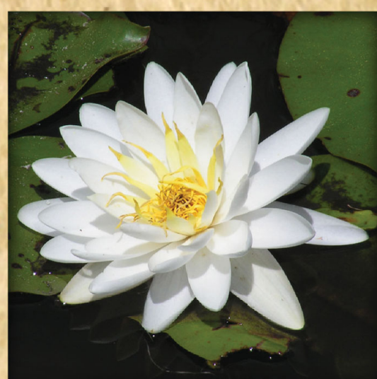
American White Waterlily Nymphaea odorata