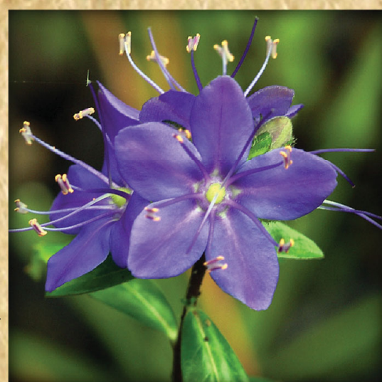
Skyflower Hydrolea corymbosa