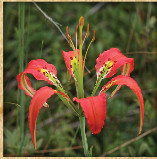
Pine Lily Lilium catesbaei