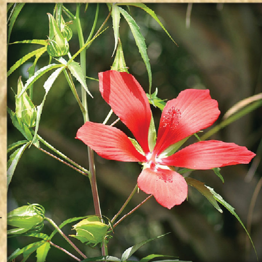
Scarlet Rosemallow Hibiscus coccineus