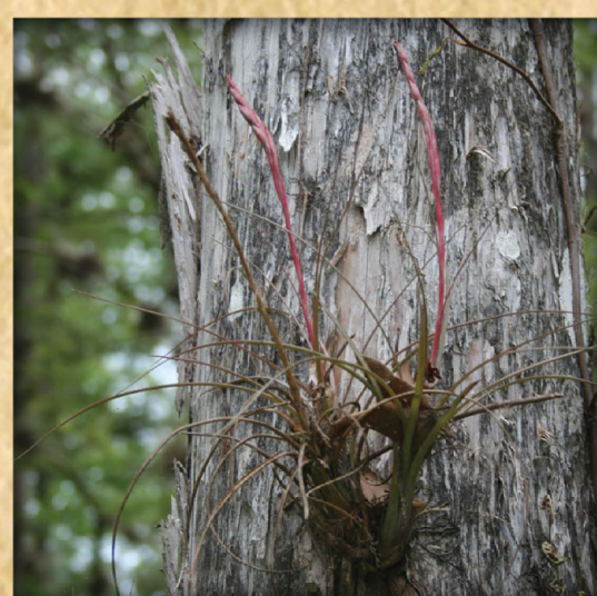
Florida Air Plant Tillandsia simulata