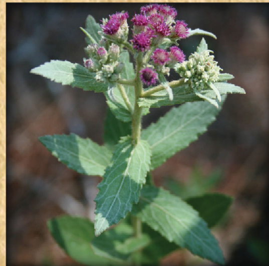
Rosy Camphorweed Pluchea baccharis