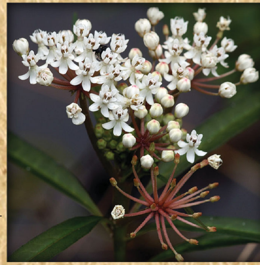
Swamp Milkweed Asclepias perennis