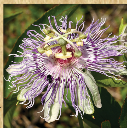
Purple Passionflower Passiflora incarnata

Through its efforts to protect water resources, the Southwest Florida Water Management District buys and manages land. As a result, plants and animals that live on these lands are also protected and the public can enjoy recreational and educational activities in the great outdoors. For a more comprehensive list containing birds, mammals, butterflies, frogs, toads, insects, trees, shrubs, reptiles, wildflowers and natural communities, please visit