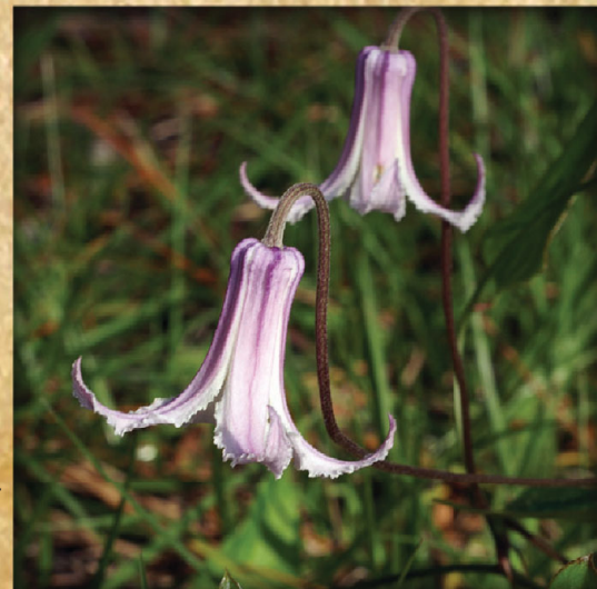
Pine Hyacinth Clematis baldwinii