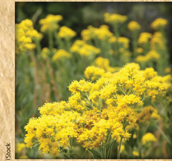
Goldenrod Solidago sp.