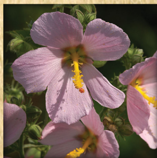
Virginia Saltmarsh Mallow Kosteletzkya pentacarpos