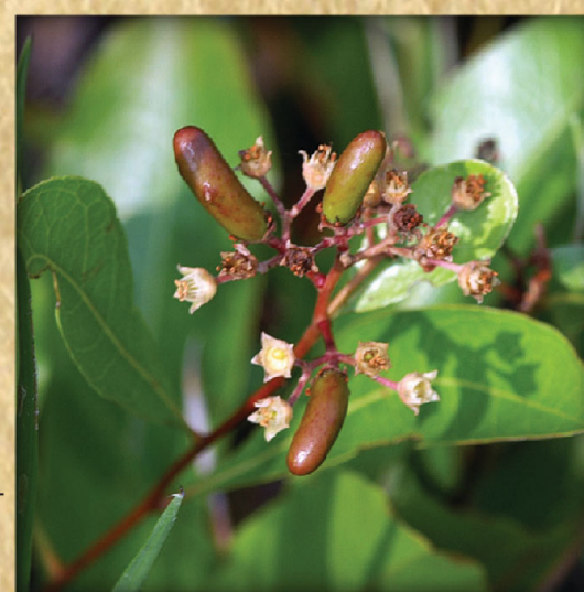
Gopher Apple Licania michauxii