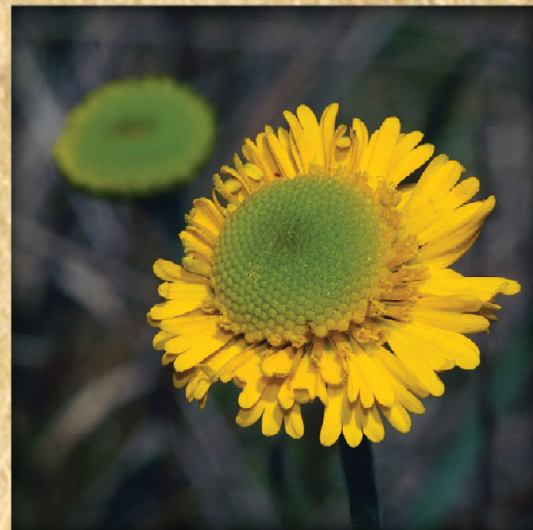
Southeastern Sneezeweed Helenium pinnatifidum