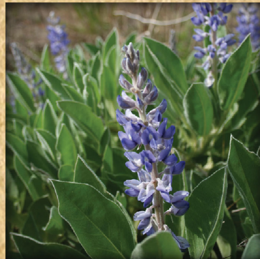
Sky-Blue Lupine Lupinus diffusus